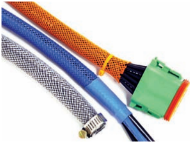
When cut with a hot knife, the sealed ends of Flexo PET allow for varied termination solutions.