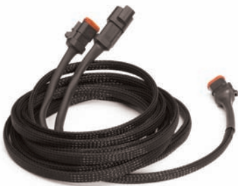
Flexo PET installs quickly in production harnessing environments, reducing assembly cost.