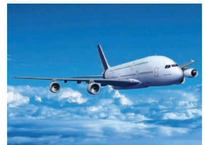
Accepted for use by major aircraft manufacturers.