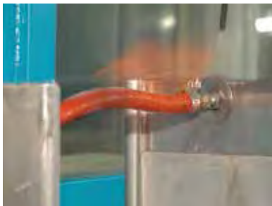
Techflex silicone jacketed fiberglass is tested under pressure to destruction to ensure reliable fire protection for your fuel and hydraulic lines.