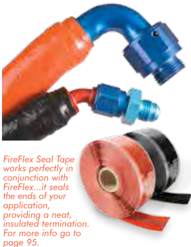
FireFlex Seal Tape works perfectly in conjunction with FireFlex...it seals the ends of your application, providing a neat, insulated termination. For more info go to page 95.